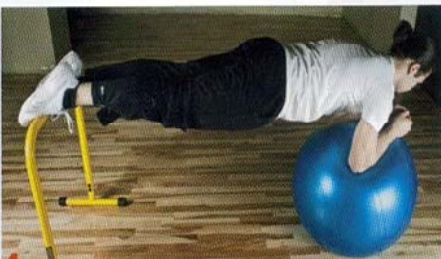
4 EQUALIZER AND STABILITY BALL SPIDERMAN PLANK

3 Standing on a single leg, balance an equalizer on your other foot, and hold the leg out. Keeping your leg straight, proceed into a deep squat, and then come up.