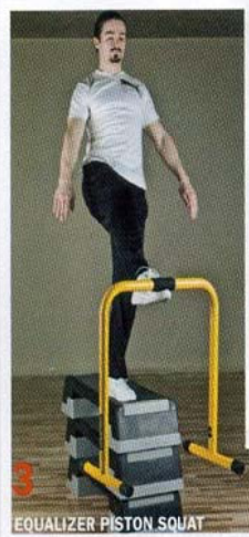
3 EQUALIZER PISTON SQUAT

Perform twelve repetitions for four sets.